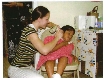
Tympanometry with restless child.