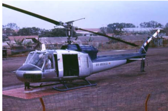
Air America Bell 204B N1304X, taken at the pad behind the Free World Building, Saigon, on 25 February 1970

Bell 204B N1304X 2196 1 July 66 bought new