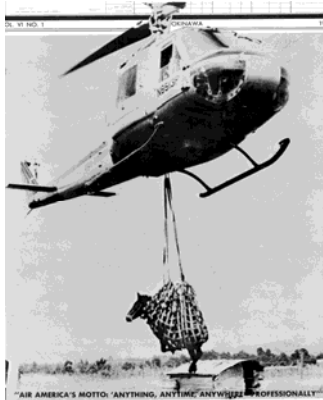
Bell 204B N8513F, carrying a mule in South Vietnam in 1972 ( Air America Log , vol. VI, no. 1, 1972, p. 1)