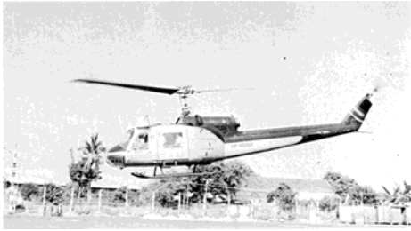
A Bell 204B at Saigon in 1968 (Air America Log, vol. III, no. 1, 1969, p. 6)