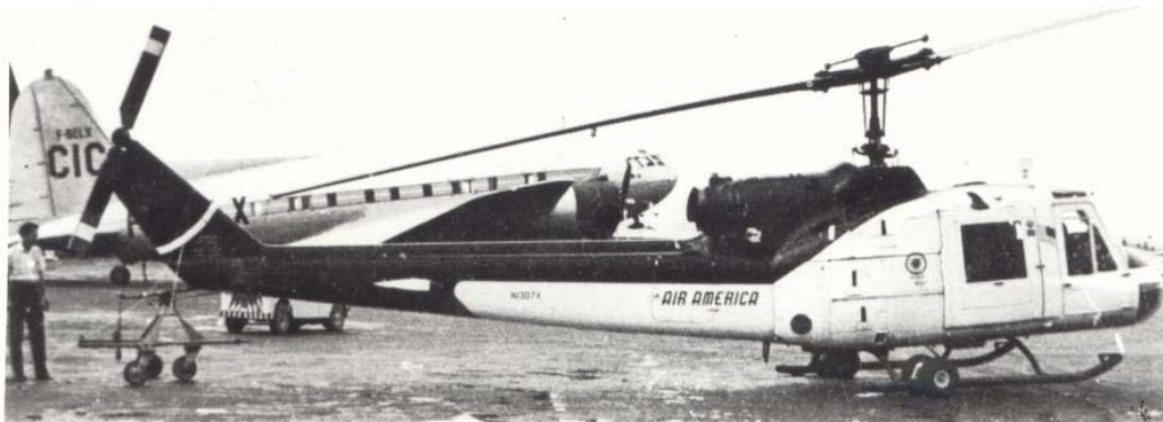
Bell 204B N1307X at Saigon in 1967, displaying the new color scheme ( Air America Log , vol. I, no. 1, 1967, p. 1)

the Inventory list made up by R. Dixon Speas Associates Inc and dated 10 and 11 November 1975, p. 15, in: UTD/CIA/B18F6; sold to Omni Aircraft Sales, Washington DC, at $ 125,000 according to the Sales Agreement of 13 November 75 (Summary of aircraft sales, in: UTD/CIA/B40F6); sold to Omni Aircraft Sales, Washington, DC, on 2 February 76 (Properties list dated 17 February 76, in: UTD/CIA/B18F9); deregistration requested on 6 February 76 (Letter by Clyde S. Carter dated 6 February 76, in: UTD/CIA/ B16F9); sold to Columbia Helicopters, Portland, OR, in 1976 (?); current in 1978-80; sold to Alaska Helicopters, Anchorage, AK, in September 81; sold to Vancouver Island Helicopters, Sydney, BC, as C-GRVW in May 83; sold to? in 1985; sold to ? as N204AQ in 1987; sold to Chet Rasberry Inc., Ketchikan, AK, on 28 February 1990; crashed during logging operation at Copper Harbor, AK, on 2 May 93; 1 killed, 1 injured; written off. Still registered to Chet Rasberry Inc. in March 2004 (request submitted to the FAA on 13 March 2004 at http://162.58.35.241/acdatabase/ ).