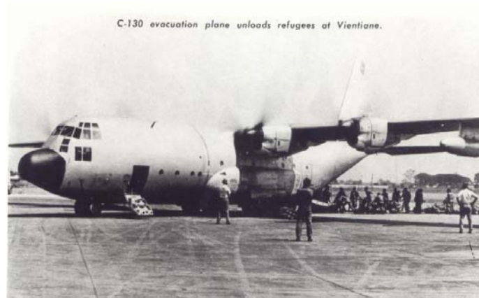
An unknown Air America C-130A taken at Vientiane during the refugee airlift in February 1970 ( Air America Log , vol. IV, no. 3, 1970, p.3)

Customer material, much of which was of a highly classified nature. During this period, the C-130s flew a total of 16 sorties, five of which were for the insertion of 751 troops to Long Tieng and the backhaul of 183,000 pounds of cargo. Between 4 and 8 February 70, E-Flight crews had to fly the C-130As of operation no. III because Air America's C-130 crews were busy with operation no. IV. 25