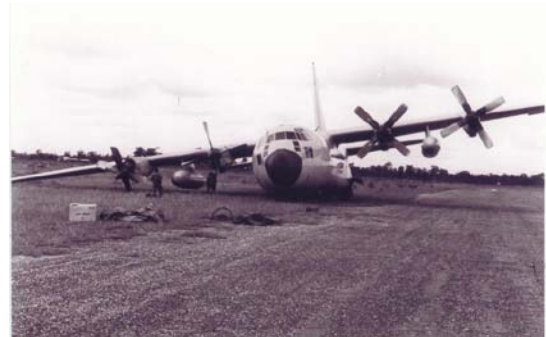
C-130E 405 accident at Seno on 30 Aug. 72 (UTD/Hitner/B2)

Lockheed C-130E "405" (40515) 3999 June 71 USAF 64-0515; had been used by the 314 th TCW, Ching Chuan Kang AB, Taiwan, in Dec. 65 and by the 50 th TAS, Ching Chuan Kang AB, Taiwan; 314 th TAW, Ching Chuan Kang, to 374 th TAW, Ching Chuan Kang, on 1 June 71 (71152); no further entries in the