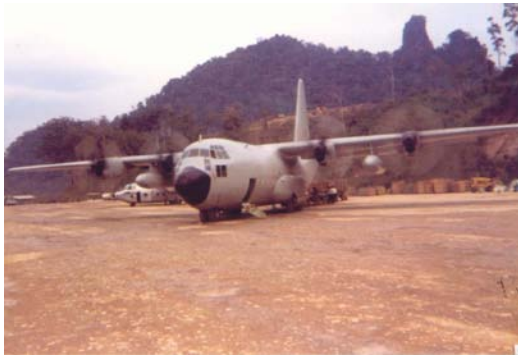
An unknown Air America C-130E at Tha Tam Bleung in the early seventies