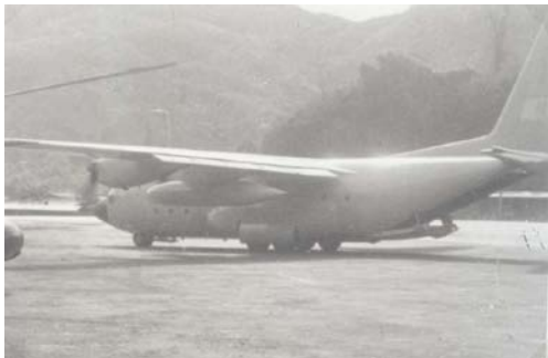
C-130E 405 at Long Tieng in 1971