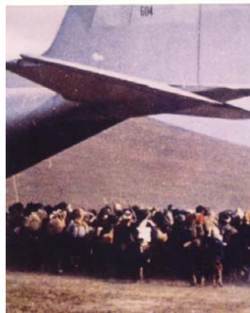
Air America C-130A "604" on the Plain of Jars in February 70 ( Air America Log , vol. IV, no. 3, 1970, p. 7)

Type registration / serial c/n (msn) date acquired origin C-130s used Air America's refugee airlifts of 1970: