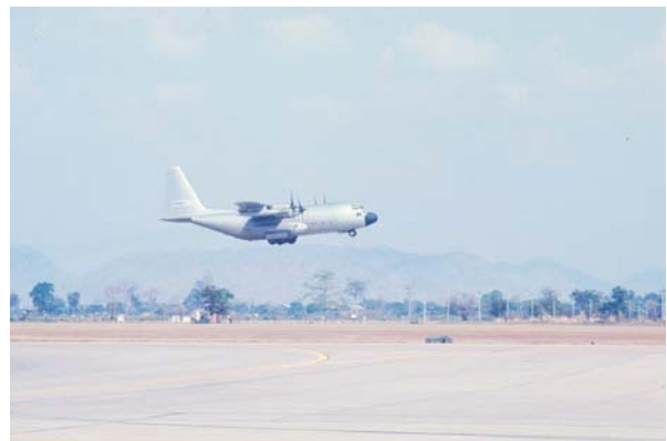
Air America C-130A “605” at Takhli RThAFB

Lockheed C-130A “605” 3118 27 Nov. 67 56000510 of E-Flight / 21 st TAS / 374 th TAW, Naha