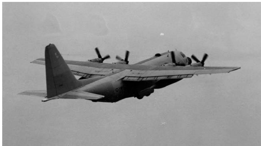
An E-Flight C-130E, probably returning from service with Air America (note the small USAF insignia next to the side door)

The C-130Es were not only used to fly large amounts of military supplies into Laos, but also to serve as troop carriers. In this role, they could carry Lao, Hmong or Thai troops between their training camps in Thailand and places in Laos or transport Hmong Groupements Mobiles within Laos, like reinforcements for MR II coming from the southern part of the country. Finally they were also used to parachute Hmong Groupements Mobiles into Laotian battle fields. 29 Miles Lechtman recalls: “We just loaded them in until there was no more room and closed up. The load was from 180 to 230, with troops.” 30 For more details about Air America’s C-130E operations see the file Air America in Laos II – military aid, Part II at http://www.utdallas.edu/library/collections/speccoll/Lecker/history/Laos2Part2.pdf .