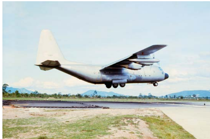
An E-Flight C-130A landing at Takhli, possibly prior to use by Air America; the aircraft still has a small USAF insignia and a standard USAF tail number ("0-")

Type registration / serial c/n (msn) date acquired origin