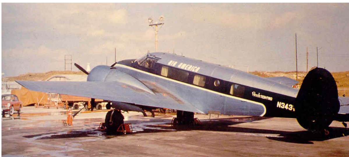
Scheduled Air Services Ryukyus Ten-Two N343T at Okinawa in the mid-sixties