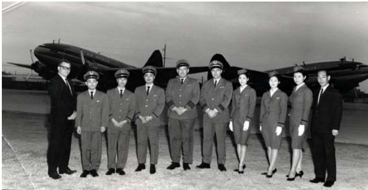
The management and crews of Scheduled Air Services Ryukyus at Christmas 1964 (UTD/Leary I B9F8, photo no. 1WL1-9-8-PEI)

On 1 July 1964, a subsidiary company of Air America called Scheduled Air Services Ryukyus began scheduled passenger and cargo operations out of Naha, Okinawa. The service started with one C-46F (N67985) on 1 July 64, a second C-46F (N67984) was added on 1 November 64. Both C-46s had a modified hydraulic system that allowed the gear to retract faster, so that they could operate out of the 3,900-foot coral strips with a load and comply with FAA requirements. 1 In February 65, Beech 10-2 N343T was added. Both C-46Fs and the Beech were painted in a different color scheme compared to the rest of the fleet: While regular Air America C-46s were all silver and while regular Air America C-45s were silver with a blue cheatline in which the name appeared in white, aircraft used in the Ryukyus had a dark blue cheatline and a silver upper fuselage; the name appeared in white letters above the cheatline, making the aircraft look like real airliners. "Prior to the establishment of SASR, Civil Air Transport had been chartering a C-46 aircraft to Okinawa Tourist Agency for flights to Miyako and Ishigaki. This was extremely unsatisfactory as the flights were unscheduled, ran only when enough passengers were rounded up to run a full flight, had no base radio facilities, etc.etc." 2 On my arrival in Taipei from Hong Kong", SASR's former manager Dan