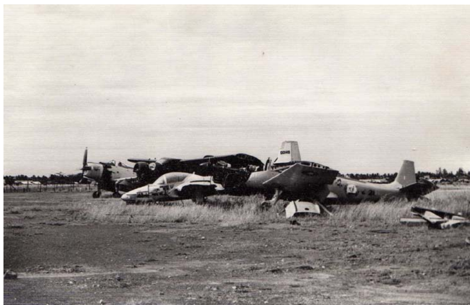
T-37B “00149” plus other aircraft at the scrap yard at Pochentong Air Base in 1971/2

Fate: believed not operational in 1970; a photo of the aircraft, still in ARK markings, cannibalised at Pochentong Airbase can be seen at Conboy / Bowra, The war in Cambodia , p. 9.