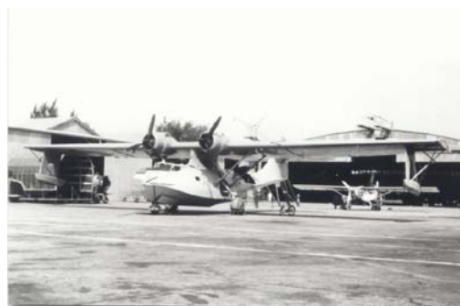
Air America PBY-5A B-825 at Tainan in the sixties