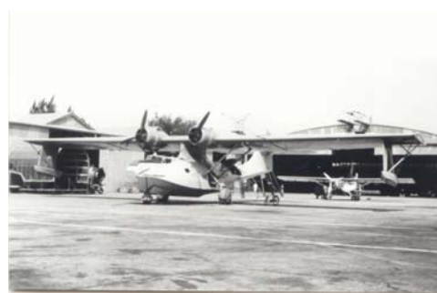
Air America PB5Y-5A B-825 at Tainan in the sixties (UTD/Foster/B1)