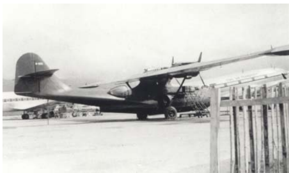
CAT PBY-5A B-825 at Tainan in the fifties