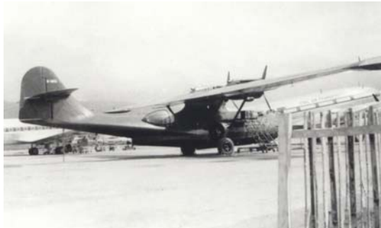
CAT PB5Y-5A B-825 at Tainan in the fifties