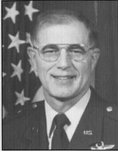
Presented by Maj. Gen. Donald W. Shepperd

“Double, Double, Toil and Trouble - Implications of the Modern World (Especially the Mid-East) for Aviation.”