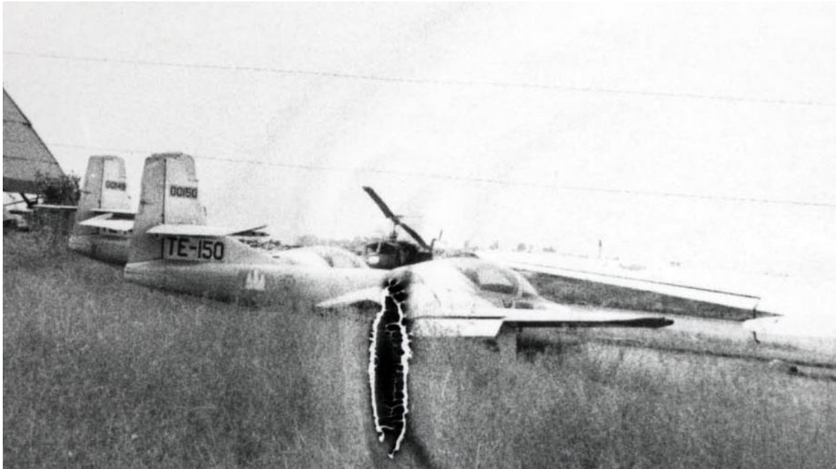
Khmer Air Force T-37Bs “00149” and “00150” at Pochentong in January 1971 (detail of photo no. 1-CA2-2-PB68 at UTD/Abadie/B2F1)

T-37B “00149” 40637 1962/3 ex 60-0149 Service history: coded “TE-150”, sitting at Pochentong airport in January 71 still in Royal Cambodian Air Force colors (see photo no. 1-CA2-2-PB68 preserved at UTD/Abadie/B2F1); mentioned in Ian Carroll, World Air Forces Directory 1998/9 , p. 187, as surviving until 1973. Fate: ?