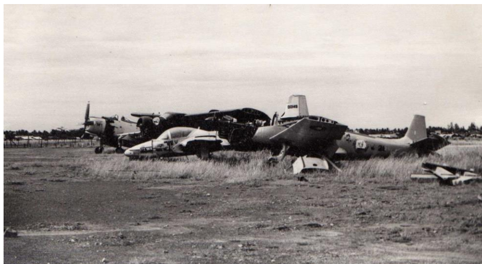
T-37B “00149” plus other aircraft at the scrap yard at Pochentong Air Base in 1971/2

T-37B “00148” 40636 1962/3 ex 60-0148 Service history: coded “TE-148”, sitting at Pochentong airport in January 71 still in Royal Cambodian Air Force colors (see photo no. 1-CA2-2-PB60 preserved at UTD/Abadie/B2F1); ; mentioned in Ian Carroll, World Air Forces Directory 1998/9 , p. 187; coded “TE-148” Fate: believed not operational in 1970; a photo of the aircraft, still in ARK markings, cannibalised at Pochentong Airbase can be seen at Conboy / Bowra, The war in Cambodia , p. 9.