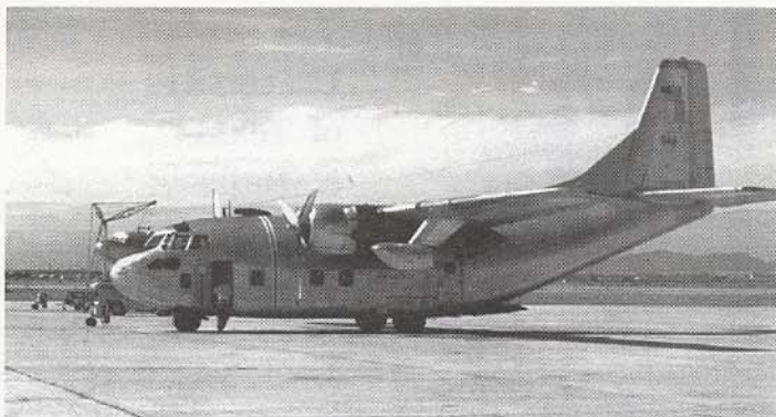
Air America C-123