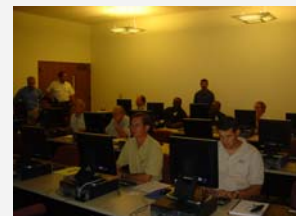
Pictures taken during the alpha test of Tier 2 Online Submit conducted in Mesquite, TX on 10/17/2005