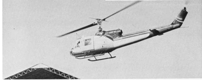
A Bell 204B at Saigon in 1969 ( Air America Log , vol. III, no. 3, 1969, p. 2)