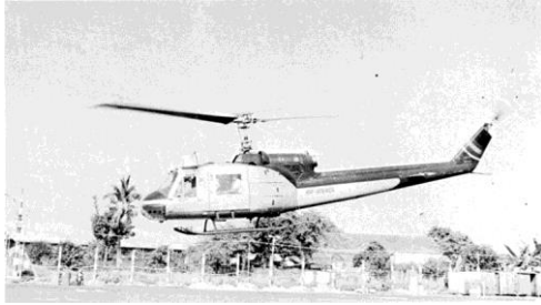
A Bell 204B at Saigon in 1968 ( Air America Log , vol. III, no. 1, 1969, p. 6)