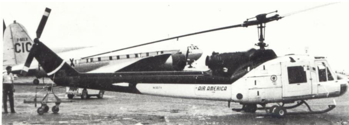
Bell 204B N1307X at Saigon in 1967, displaying the new color scheme ( Air America Log , vol. I, no. 1, 1967, p. 1)

12 September 75; awaiting sale at Roswell at least between 12 and 30 September 75 (Letter by Clyde S. Carter dated 22 May 75, in: UTD/CIA/B17F4; Air America, owned aircraft as of 30 September 75, in: UTD/CIA/B56F1); a photo is contained in the Inventory list made up by R. Dixon Speas Associates Inc and dated 10 and 11 November 1975, p. 15, in: UTD/CIA/B18F6; sold to Omni Aircraft Sales, Washington DC, at $ 125,000 according to the Sales Agreement of 13 November 75 (Summary of aircraft sales, in: UTD/CIA/B40F6); sold to Omni Aircraft Sales, Washington, DC, on 2 February 76 (Properties list dated 17 February 76, in: UTD/CIA/B18F9); deregistration requested on 6 February 76 (Letter by Clyde S. Carter dated 6 February 76, in: UTD/CIA/ B16F9); sold to Columbia Helicopters, Portland, OR, in 1976 (?); current in 1978-80; sold to Alaska Helicopters, Anchorage, AK, in September 81; sold to Vancouver Island Helicopters, Sydney, BC, as C-GRVW in May 83; sold to? in 1985; sold to ? as N204AQ in 1987; sold to Chet Raspberry Inc., Ketchikan, AK, on 28 February 1990; crashed during logging operation at Copper Harbor, AK, on 2 May 93; 1 killed, 1 injured; written off. Still registered to Chet Raspberry Inc. in March 2004 (request submitted to the FAA on 13 March 2004 at http://162.58.35.241/acdatabase/ ).