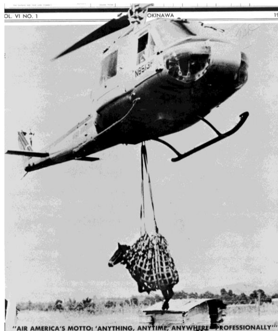
Bell 204B N8513F, carrying a mule in South Vietnam in 1972 ( Air America Log , vol. VI, no. 1, 1972, p. 1)