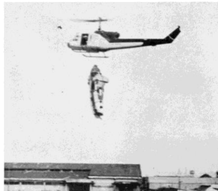
An Air America Bell 204B airlifts the ill-fated Do-28 B-931 back to Saigon in November 67 ( Air America Log , vol. II, no. 5, 1968, p. 2)