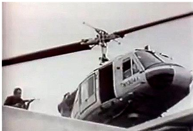
Bell 204B N1304X on the US Embassy roof, Saigon, on 29 April 1975

( www.youtube.com via http://www.uswarplanes.net/ )