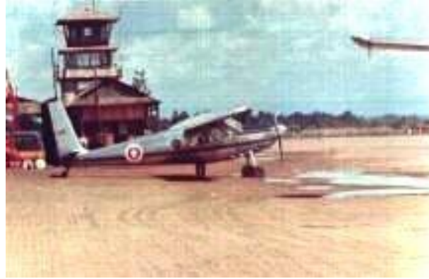
An unknown Helio Courier in Royal Lao Air Force colors, taken by Benjamin F. Coleman in late 1969 or early 1970 (photo used here with kind permission from Leigh Coleman Hotujec)

First published on 4 March 2013, last updated on 24 August 2015