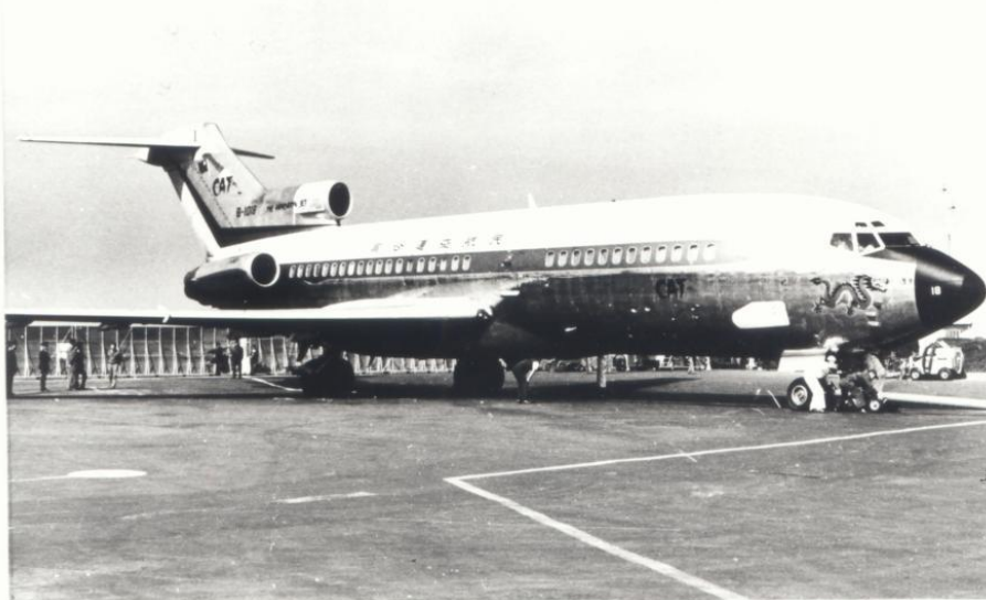
CAT Boeing 727 B-1018, taken at Taipei in January or February 68

Boeing 727-92C N5093 19175 10 Dec. 66 bought new; acquired via Air Asia