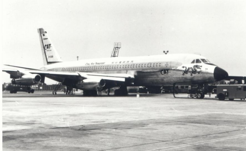
CAT Conqair 880M B-1008 ( The Mandarin Jet ) at Taipei in the early sixties