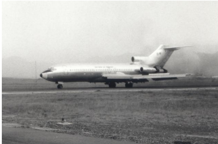
Southern Air Transport Boeing 727 N5092 at Nha Trang in 1968 (UTD/Misc.Mat./B4F4)

Boeing 727-92C N5092 19174 5 Nov. 66 bought new; acquired via Air Asia