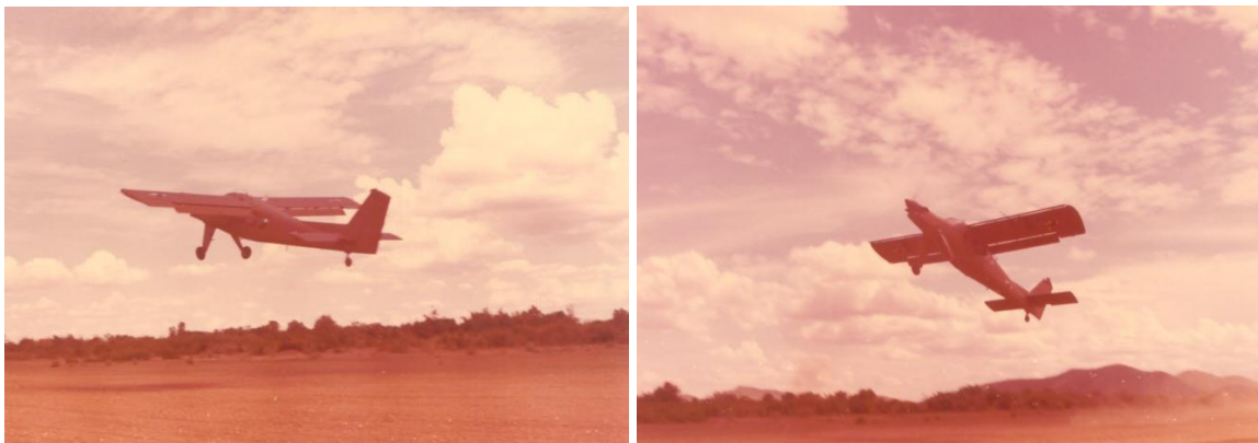
The STOL capacity of a Khmer Air Force AU-24A, demonstrated in May 73