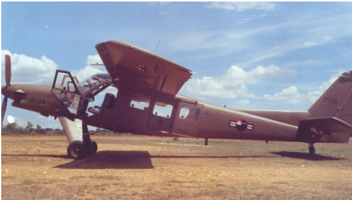
Khmer Air Force AU-24A “21331”

Fate: unknown; did not escape to Thailand, when Cambodia fell to the Khmer Rouge forces in 1975.