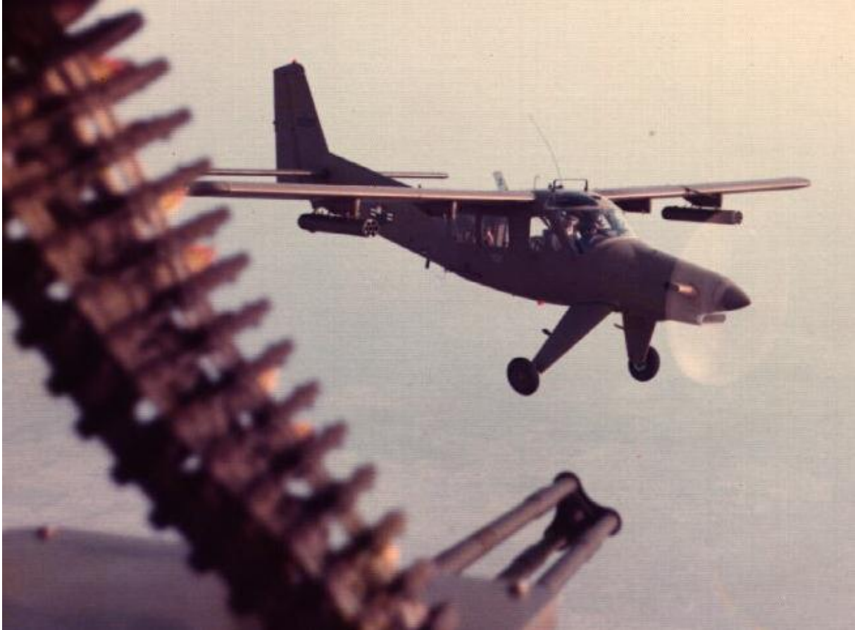
A Khmer Air Force AU-24A enroute back to Takhli RTB from a gunnery training mission in May 73

First published on 29 May 2006, last updated on 24 August 2015