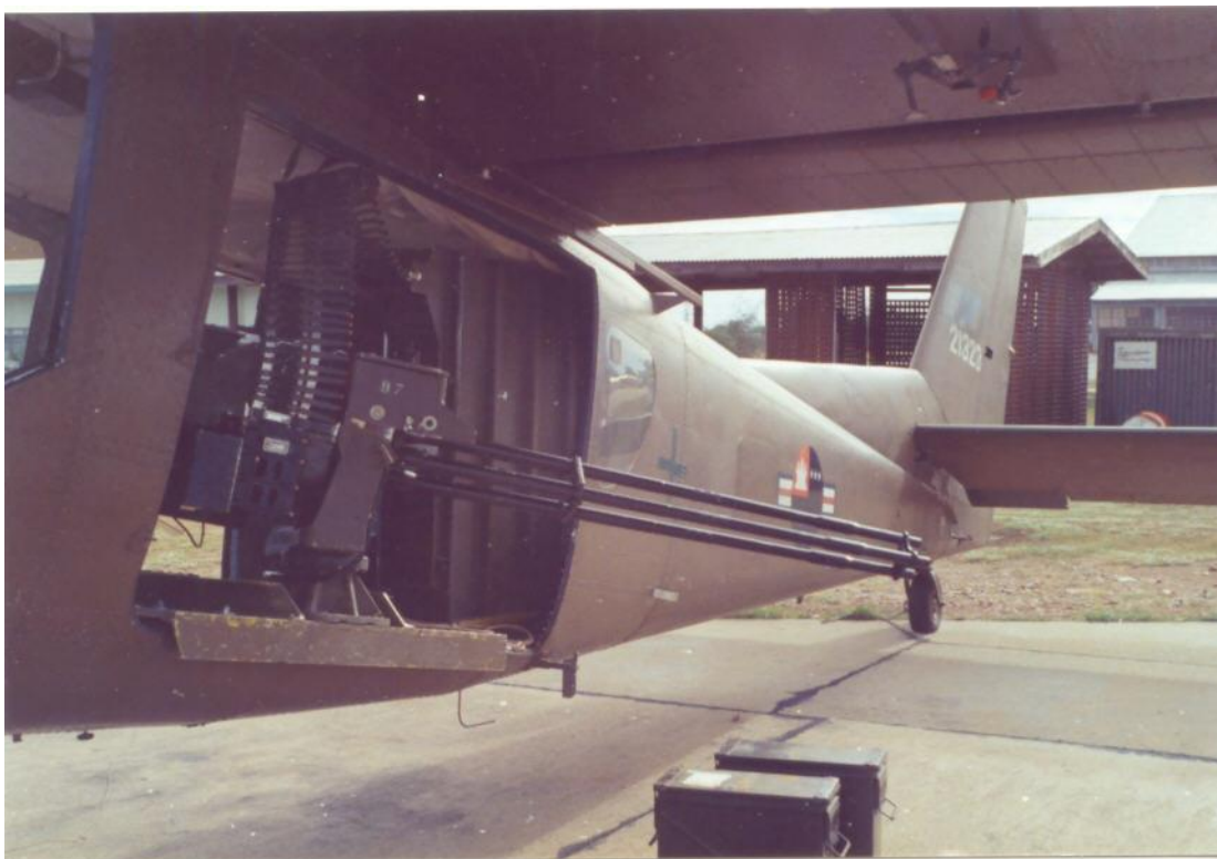
The gun of Khmer Air Force AU-24A “21323”