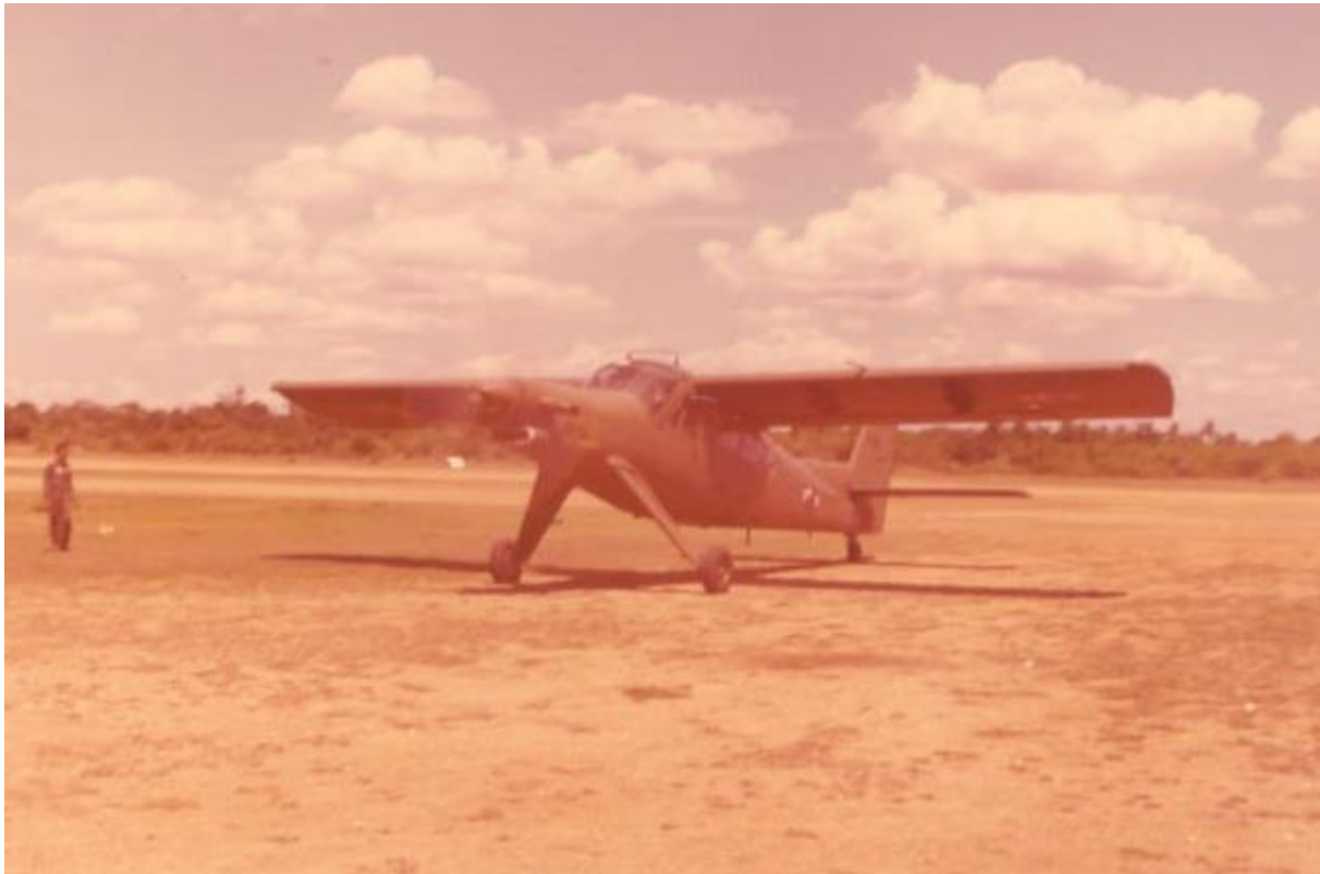
A Khmer Air Force AU-24A in May 73