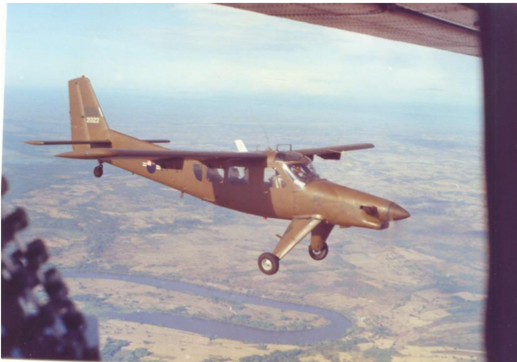
Khmer Air Force AU-24A “21322”