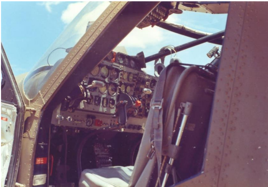
The cockpit of a Khmer Air Force AU-24A, taken in May 73

Fate: unknown; did not escape to Thailand, when Cambodia fell to the Khmer Rouge forces in 1975.