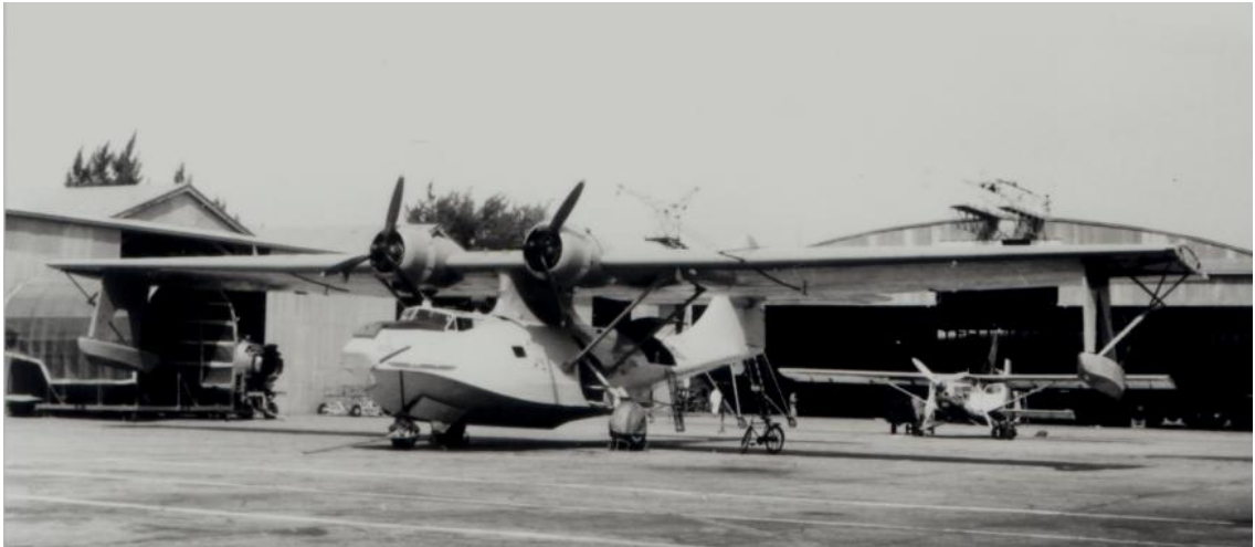
Air America PBY-5A B-825 at Tainan in the sixties, light colors and without blisters (UTD/Foster/B1)

N(713)55-169-9-64 on 8 April 66 (Aircraft status as of 8 April 66, in: UTD/Kirkpatrick/B1F1) and on 4 May 66 (Aircraft status as of 4 May 66, in: UTD/Hickler/B1F2); on 15 May 66, the nose wheel collapsed on take-off from Taipei (Aircraft accidents 1966, in: UTD/CIA/B49F2); repaired; a photo taken probably at Tainan in the mid-sixties (there is a PC-6 in the background) can be found in UTD/Foster/B1; at that time the aircraft was all silver; unassigned and on long term storage at Tainan in May 68 (Aircraft status as of 1 May 68, in: UTD/Herd/B2).