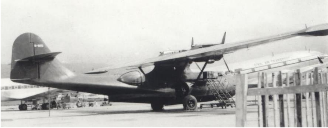
CAT PBY-5A B-825 at Tainan in the fifties, with blisters and Navy blue (UTD/Kirkpatrick/B18)

Cons. PBY-5A B-825 1803 (31 Mar. 59) leased from Air Asia; acquired by CAT Inc. in July 52; previously BuA 48441, then N4856V