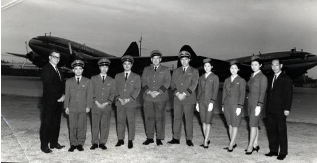
The management and crews of Scheduled Air Services Ryukyus at Christmas 1965 (former photo no. 1WL1-9-8-PB1, preserved at UTD/Leary/B76F8)

First published on 29 May 2006, last updated on 24 August 2015