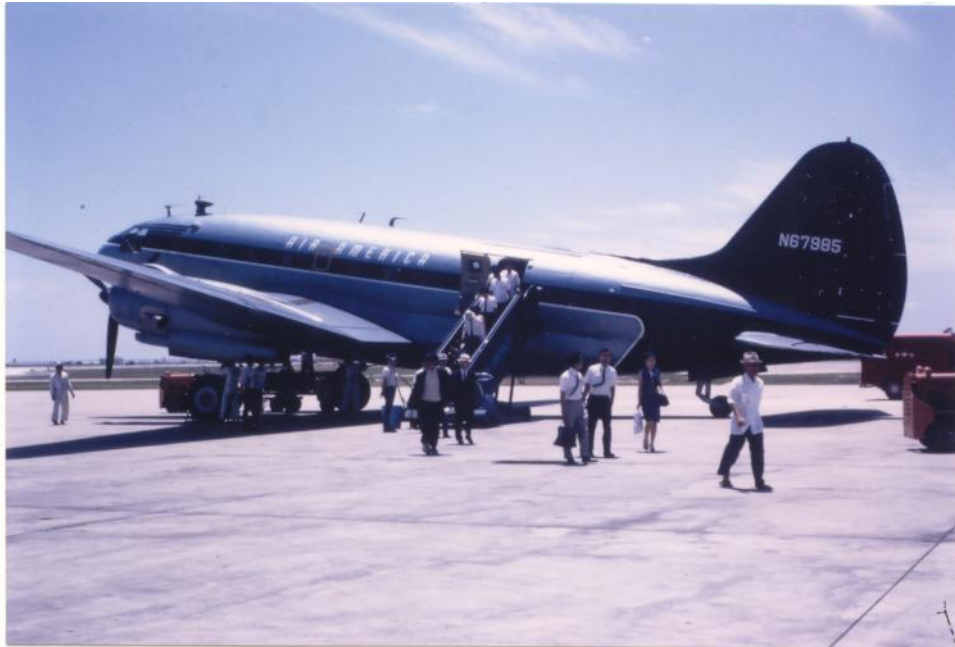
Scheduled Air Services Ryukyus C-46F N67985 on Okinawa in May 67