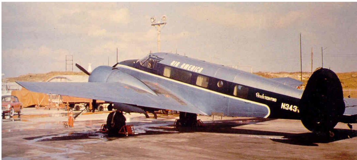
Scheduled Air Services Ryukyus Ten-Two N343T at Okinawa in the mid-sixties