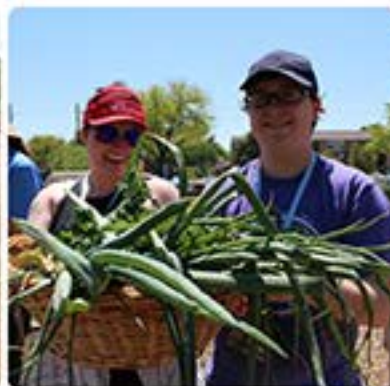
Senior plot holders lead a Garden Workshop during Earth Week