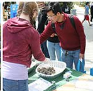
Gardeners make wildflower seed balls with Earth Fair attendees