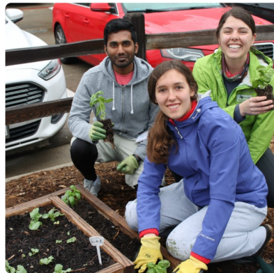
Basil transplants were added to the Basil Bed