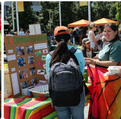
Gardeners made seed balls with attendees at the Earth Fair