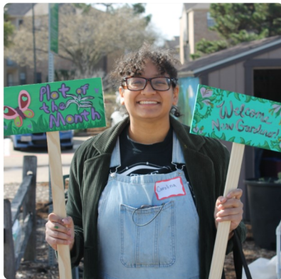
Volunteers updated garden signage