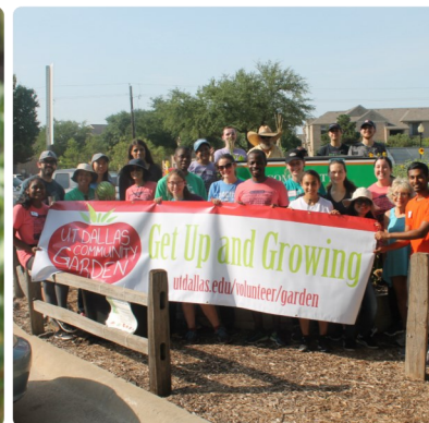
A new logo was rolled out just in time for the new school year