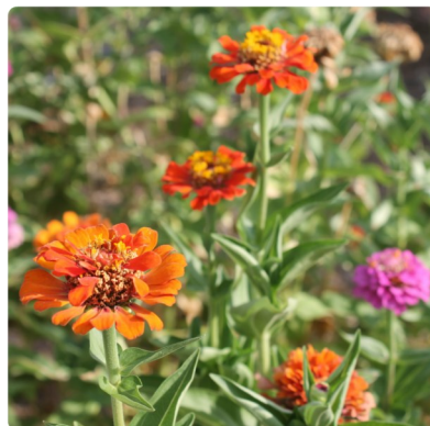
The pollinator garden adds color and attracts beneficial insects