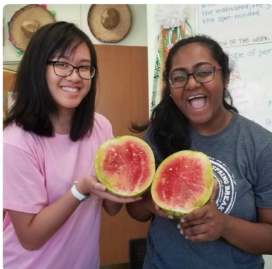
186 lbs. of watermelon was shared among gardeners